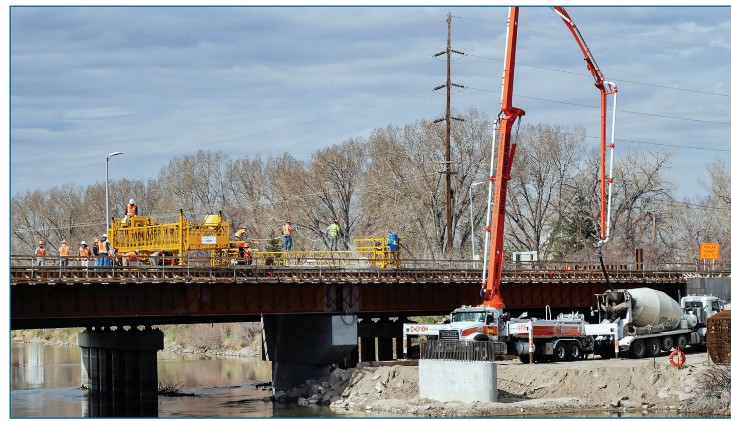
Workers with general contractor Ames Construction keep the concrete flowing April 24 as they pour the concrete deck atop the northbound I-25 bridge over the North Platte River in Casper.