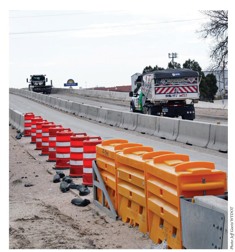
Both directions of traffic are currently using the southbound lanes of I-25 through much of Casper as work continues on a two-year project to replace five aging bridges over the North Platte River and Center Street.